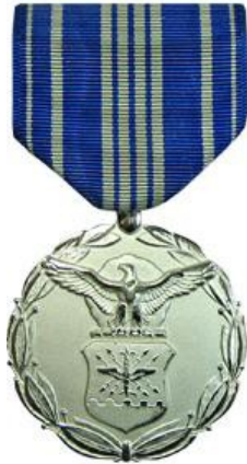
(Added)(DAF) Figure 8. Air Force Civilian Achievement Award.

c. (Added)(DAF) Award Description. A pewter-colored medal bearing the Air Force coat of arms within a wreath of laurel leaves. The ribbon has three sets of four vertical stripes of silver gray on an ultramarine blue background. An illustration of the medal is provided at Figure 8.